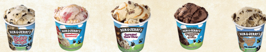
Cookie Dough Strawberry Cheesecake Caramel Chew Chew Chocolate Fudge Brownie Peanut Butter Cup